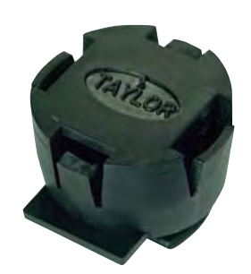
TagSafe - Holder Only